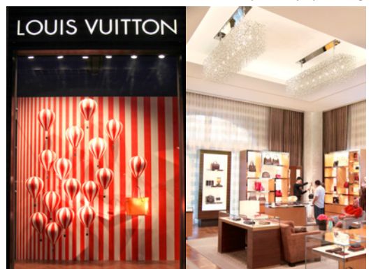
Louis Vuitton Boutique (Las Vegas)